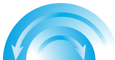
Two-Stage Watering Pattern